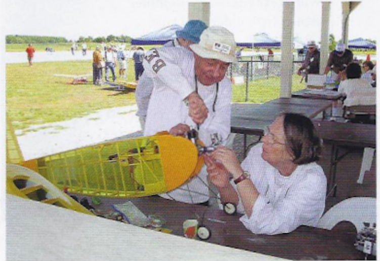
The Griswolds troubleshoot Dick's Texaco entry