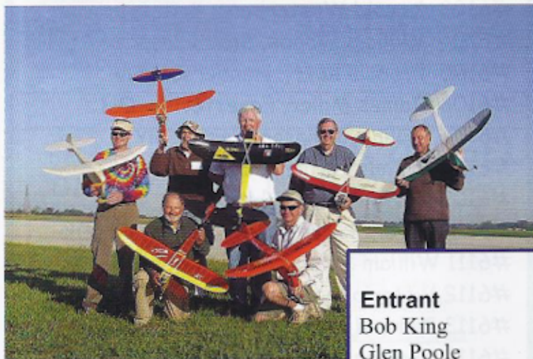
The Wedgy Gang